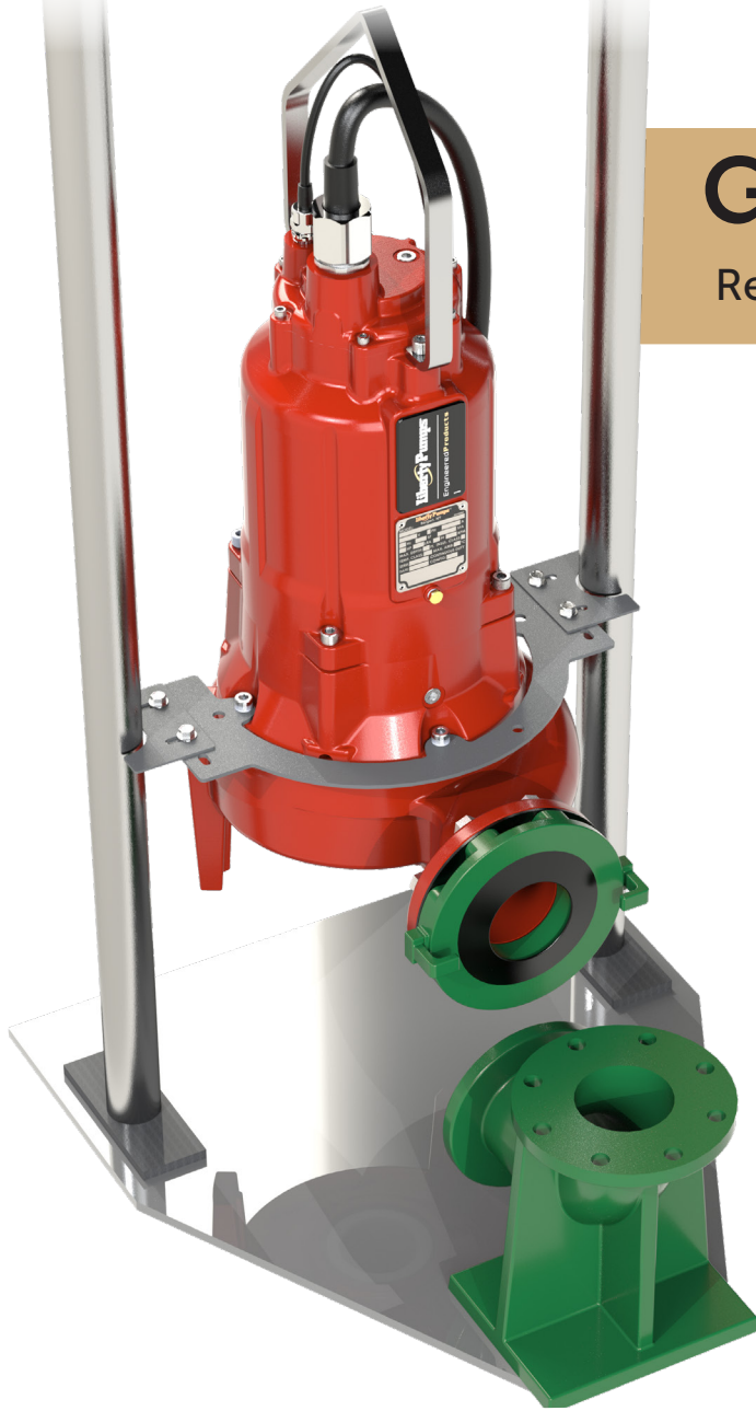
3LM-Series Model Shown

Retrofit for Hydr-O-Rail Guide Rail System